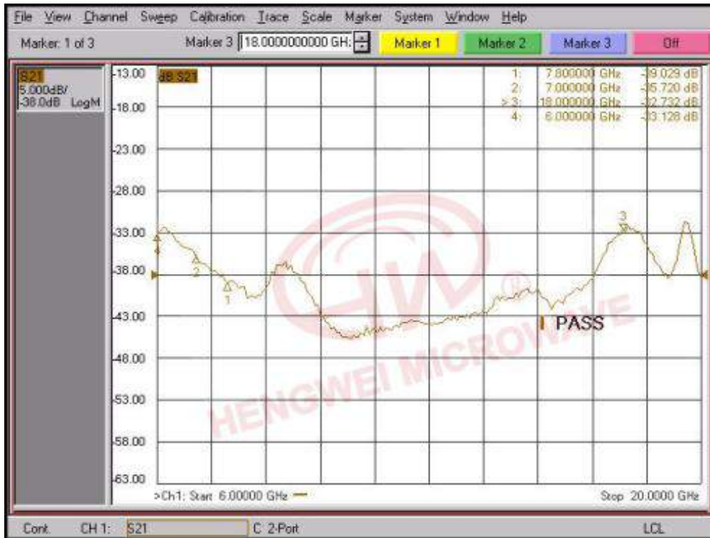
L-R Test Curve