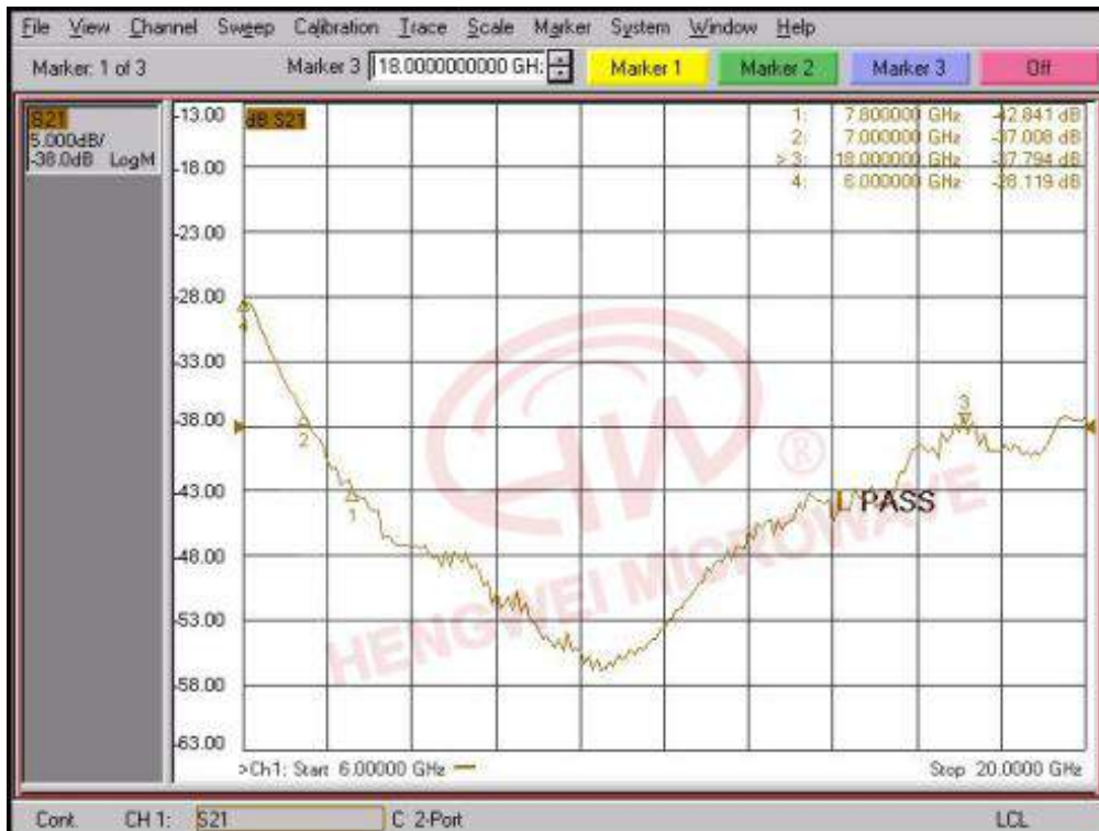
L-I Test Curve